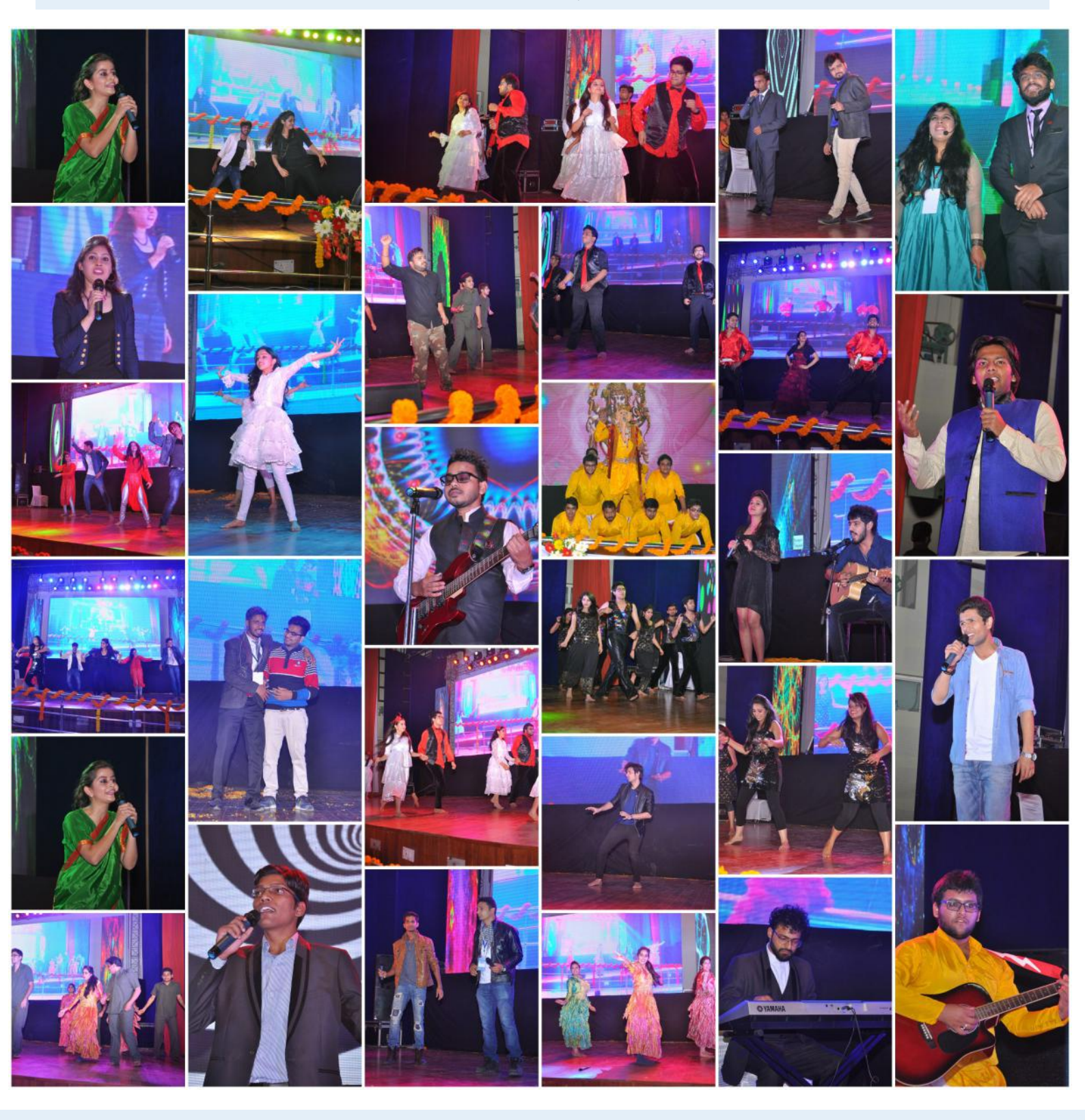
Day 1: National Convention 2016 - Cultural Evening