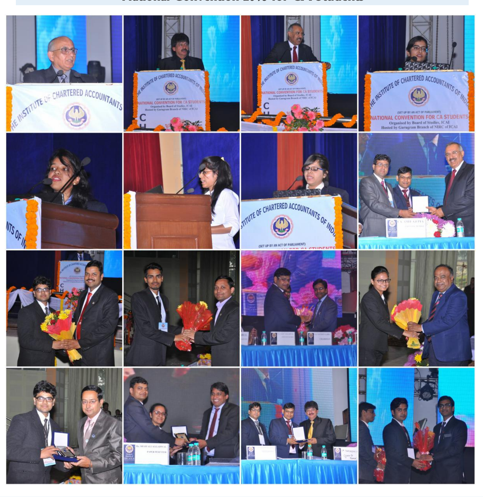
Day 1: National Convention 2016 - Technical Session- Part- II